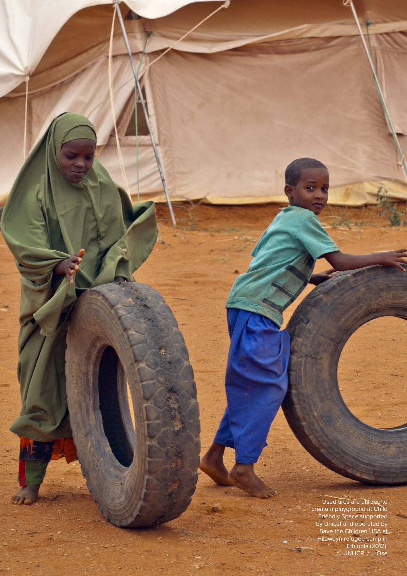
Used tires are utilized to create a playground at Child Friendly Space supported by Unicef and operated by Save the Children USA at Hilaweyn refugee camp in Ethiopia (2012).