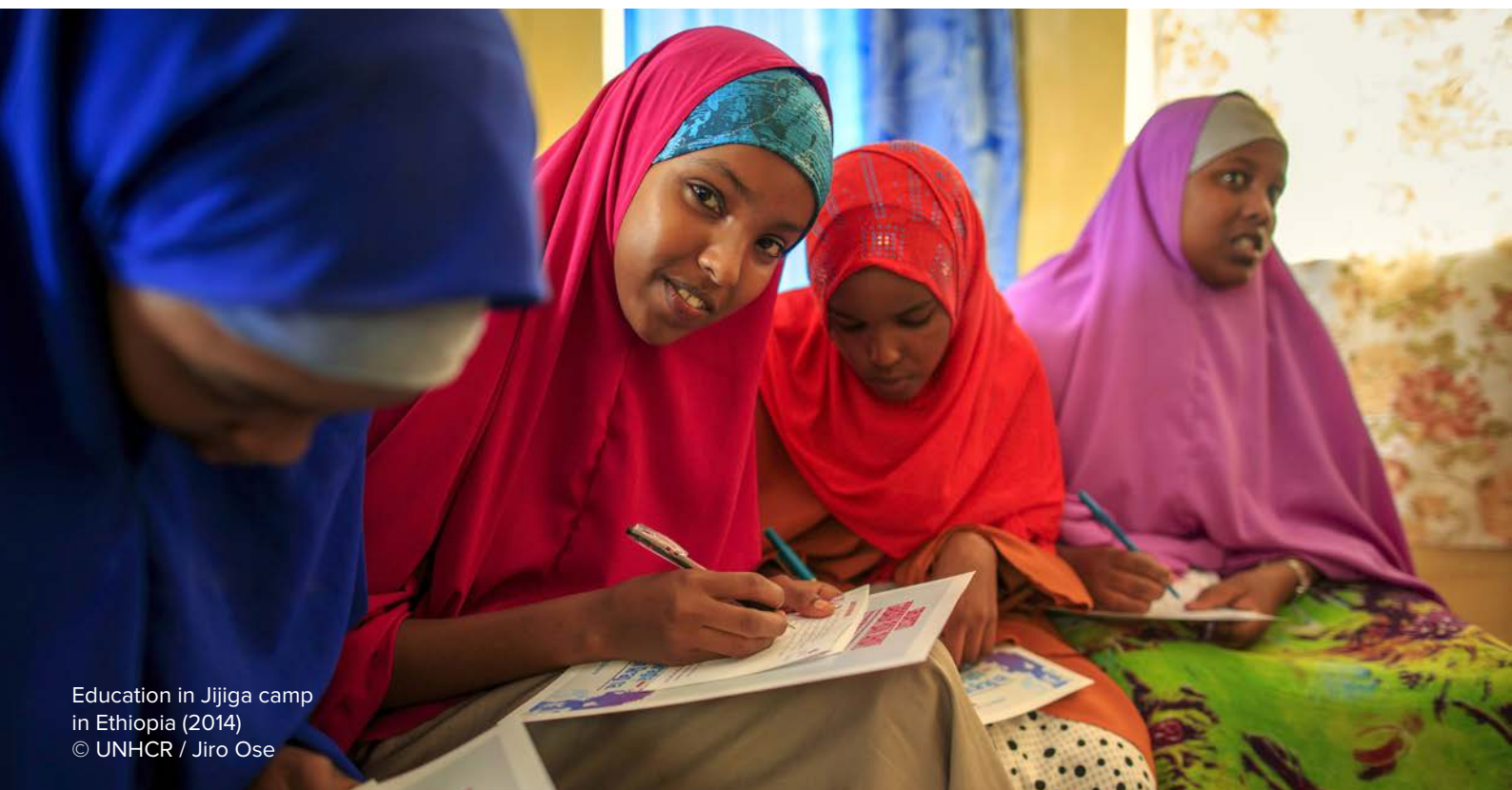
Education in Jijiga camp in Ethiopia (2014)

In this report, healing practices that are not strictly religious nor biomedical are referred to as 'traditional'. However, it must also be acknowledged that in practice, there is often some overlap between Islamic and traditional healing. Table 4 lists care practices for specific causes of mental health distress. The most frequent options used are then individually addressed and described in the sub-chapters below.