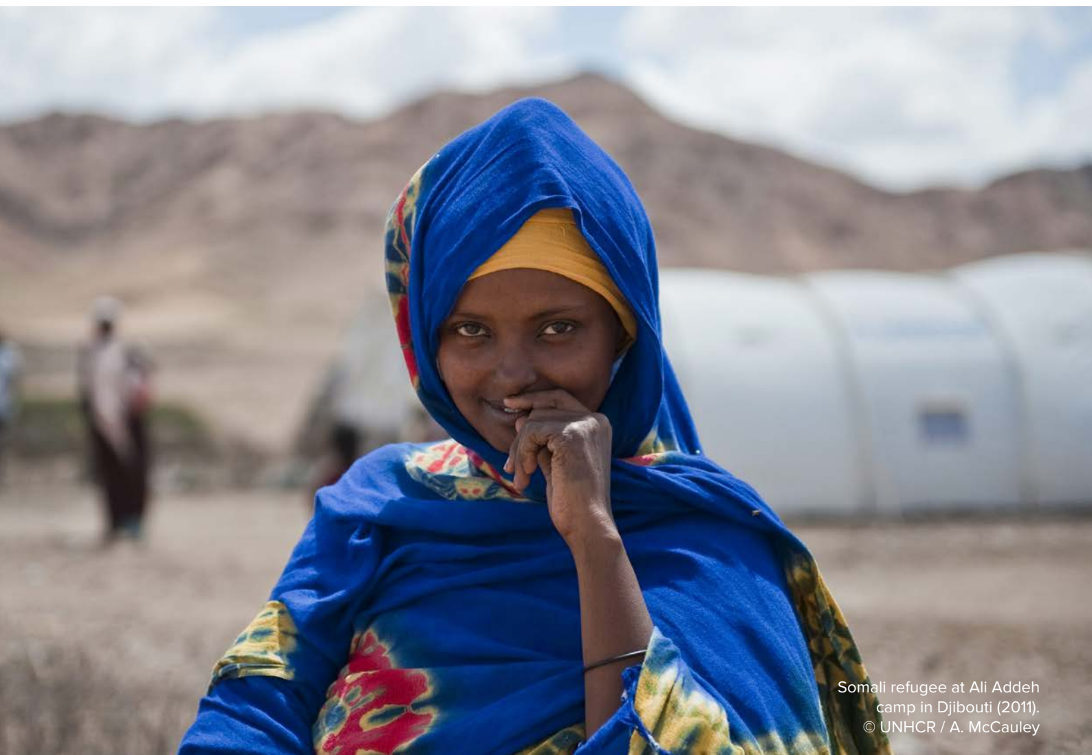
Somali refugee at Ali Addeh camp in Djibouti (2011).

In Somalia, the traditional concepts for mental distress are much more fluid than psychiatric, western categories (118). People who suffer from mental distress, but do not act ‘crazy’, are usually not seen as ‘mentally ill’, and the description of distress may not fall into any specific western psychiatric category. However, these conditions may lead to serious suffering if the person is not able to recover from them. As mentioned in the WHO report, ‘ mental health (caafimadka maskaxda) and treatment (daawayn) are still relatively new concepts among many Somalis ’ (76). For that reason, when talking about mental distress it is always important to remember that emotional states, by themselves, are not the central concern of the Somali population. Zarowsky highlights the fact that ‘ there are abstract terms for what are considered emotional states, but these words are always linked to concrete experiences ’ (122). In Somali culture, mind, body and spirit are seen as a whole, and for many Somalis it may be odd and unusual to define their distress in psychological terms.